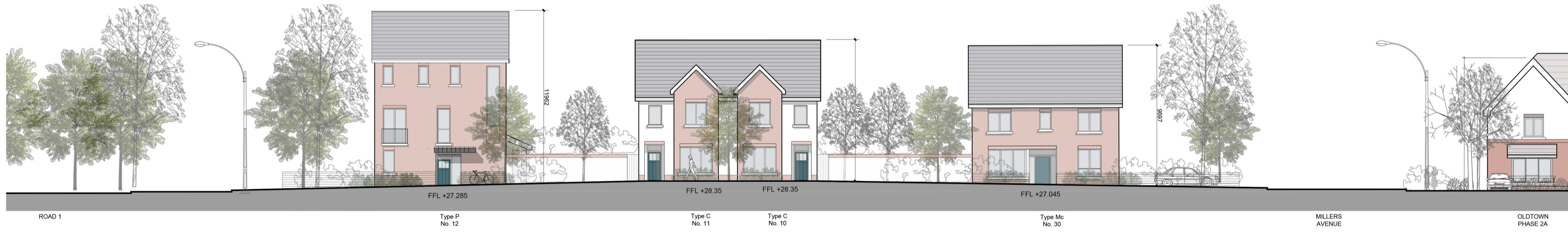
Contiguous Elevation J-J