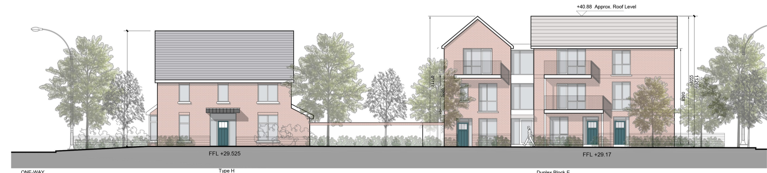
Contiguous Elevation L-L