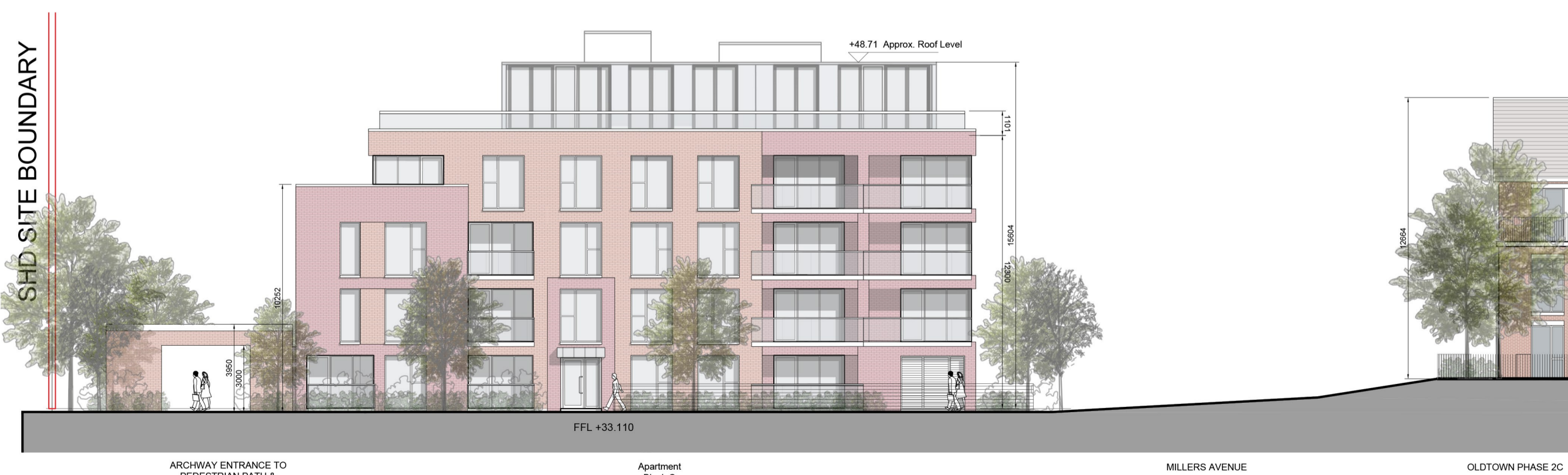
Contiguous Elevation N-N