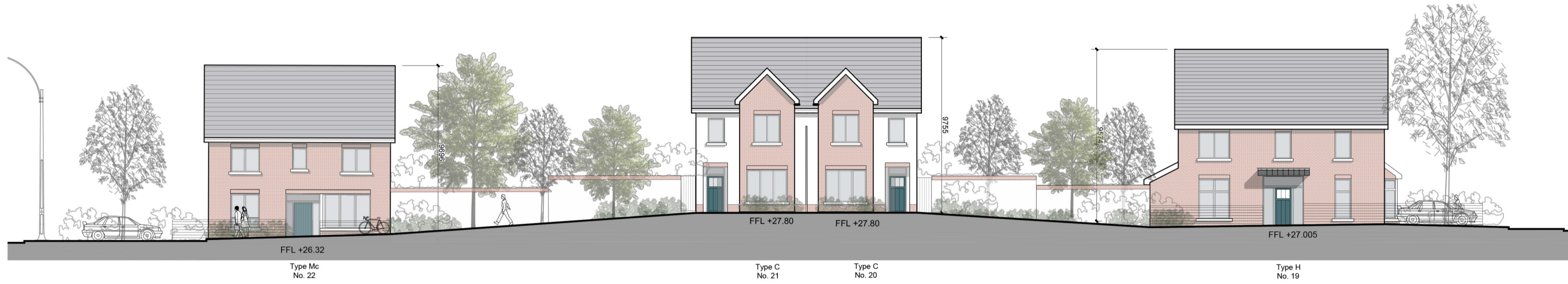
Contiguous Elevation I-I