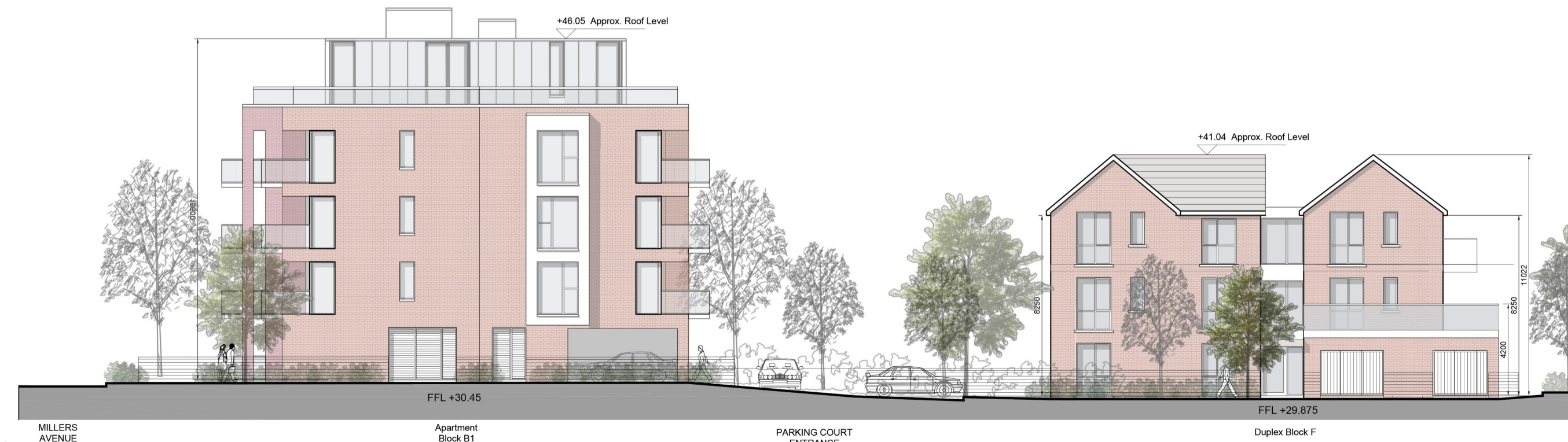
Contiguous Elevation M-M